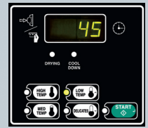
Micro-DISPLAY Control Dryer